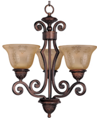
11235SAOI Symphony 3-Light Chandelier