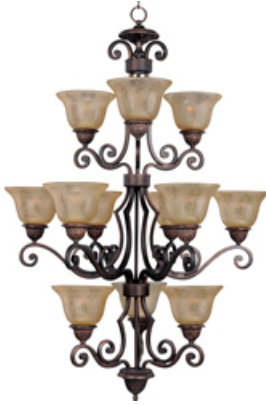
11238SAOI Symphony 12-Light Chandelier