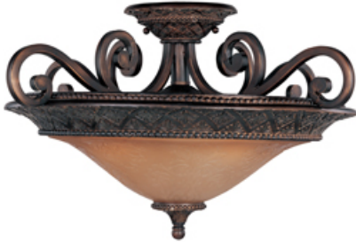
11241SAOI Symphony 3-Light Semi-Flush Mount