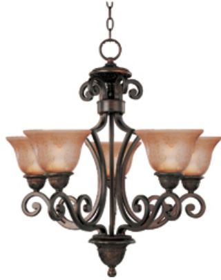
11244SAOI Symphony 5-Light Chandelier